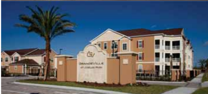
GrandeVille at Jubilee Park | Multi-family