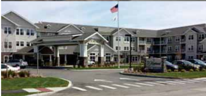
The Highlands Gracious Retirement Living