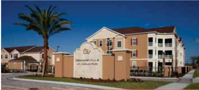
GrandeVille at Jubilee Park | Multi-family